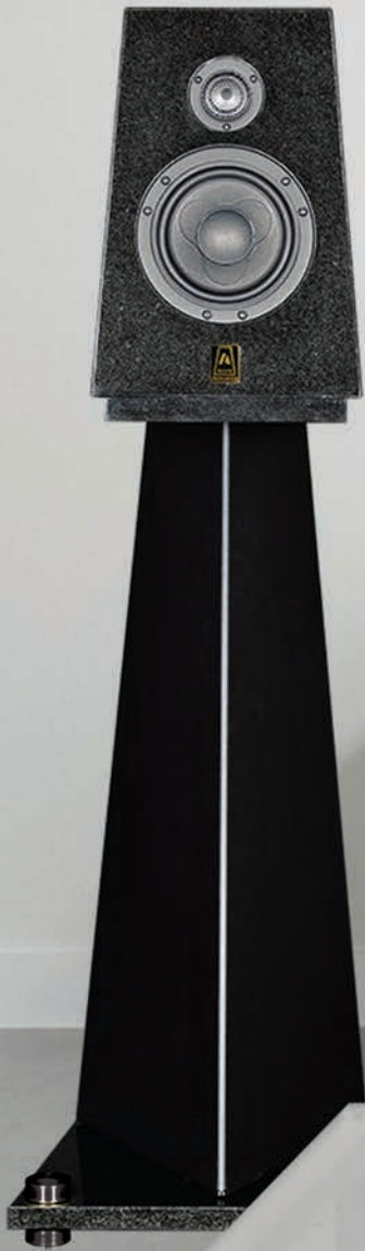
Shown with optional SRS Stands